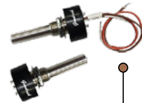
GA-02 Bare Pot