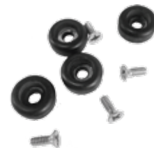
PK-02 Pedal Foot Kit