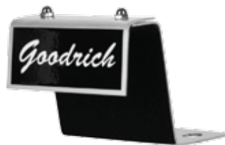
GA-01 Pedal Bracket