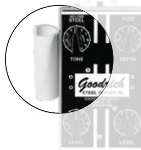
GA-04 Leg Mount