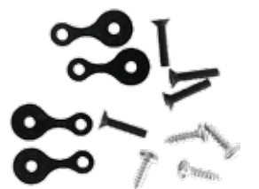
PK-03 Pedal Mount Kit