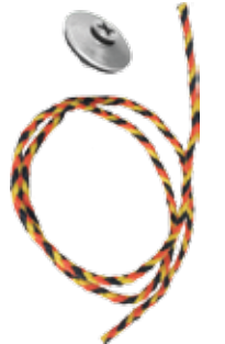
PK-01 Pedal String Kit